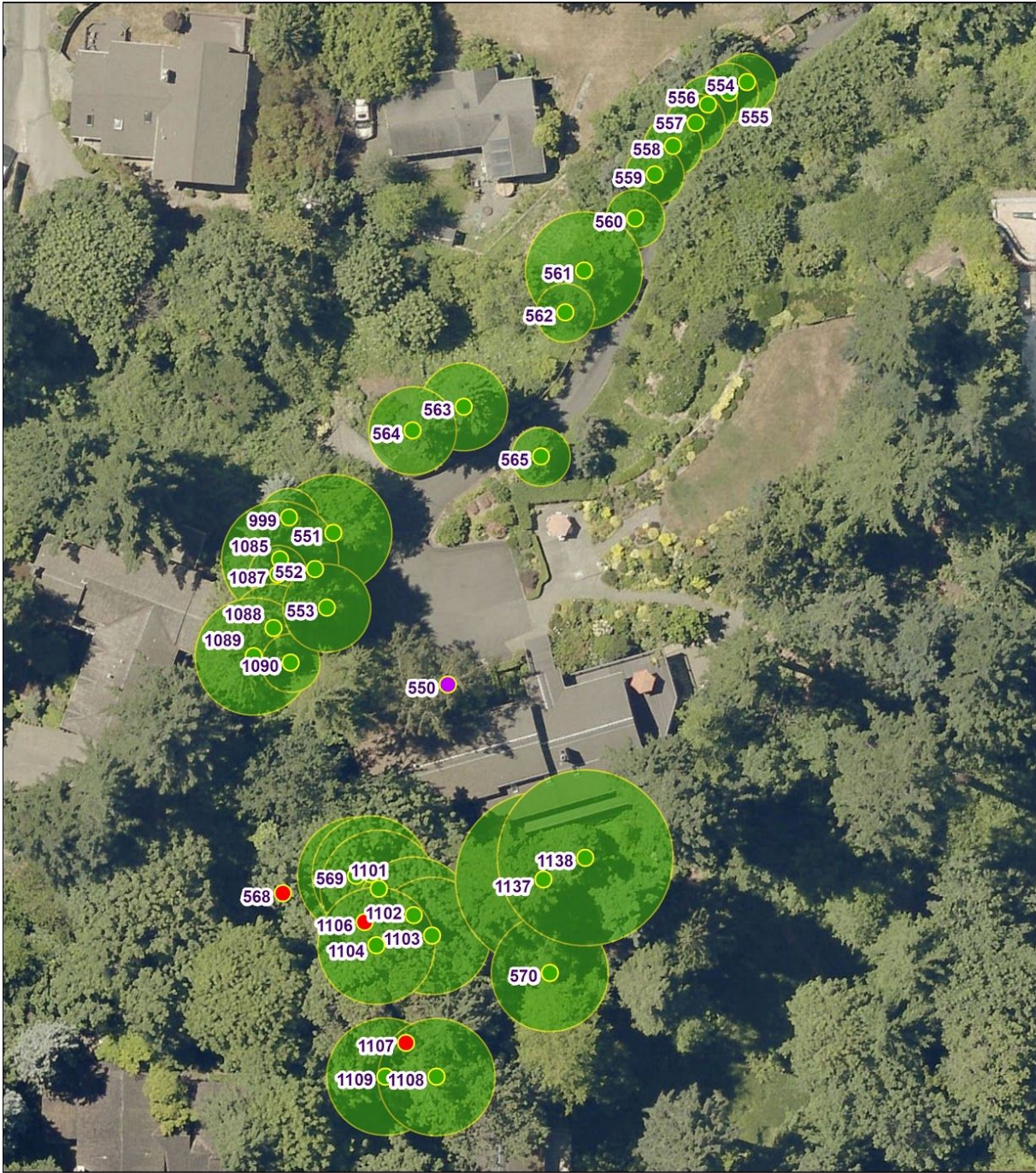
Map A1. Site Map showing tree locations and average canopy dimensions.